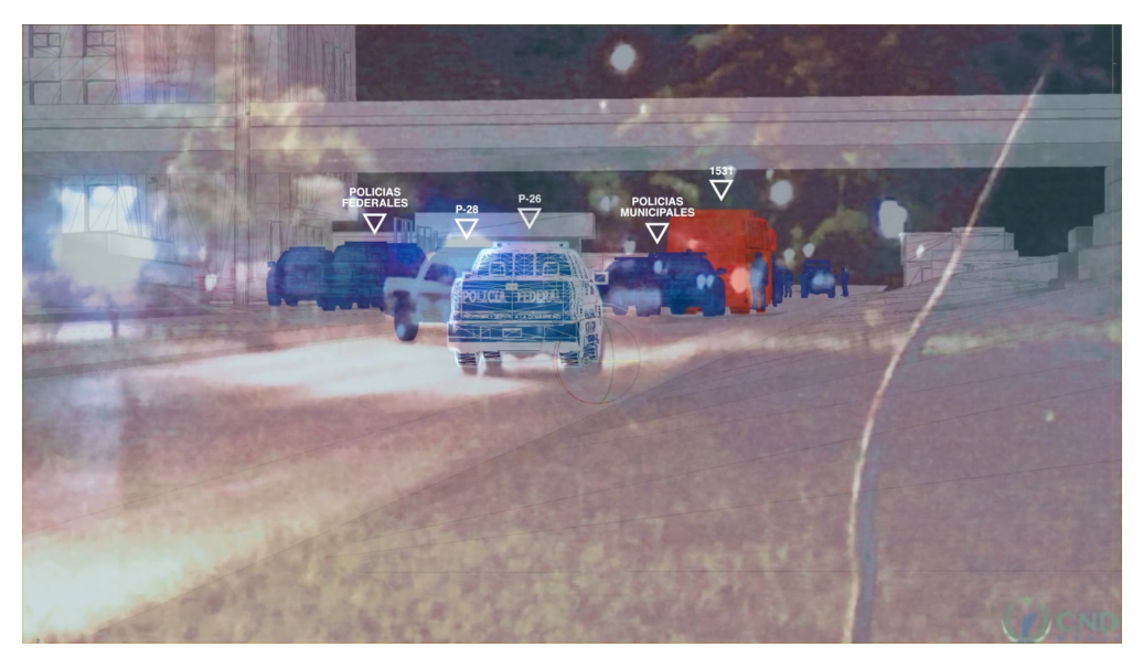
'The Ayotzinapa Case: A Cartography of Violence', 2017. Full caption on page 3.

COUNTER INVESTIGATIONS: FORENSIC ARCHITECTURE 7 March – 6 May 2018