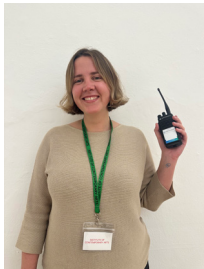
Operations and Visitor Services Manager