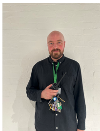
Operations and Visitor Services Manager

All staff will be wearing an ICA lanyard, you can use this to identify us if you need any assistance.